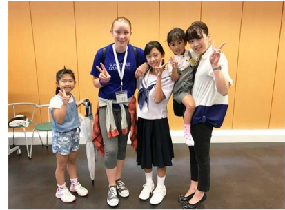
Flashing peace signs with a newly met host family in lizuka

My family started hosting lizuka students three years ago, and I've looked forward to visiting Japan ever since. Japan was everything I hoped it would be! Two days in Tokyo made a great start to the trip. The people in lizuka were very welcoming and friendly. My host family took great care of me and now I miss them like a second family! I loved all of the food, but my favorite part of the trip was attending school. It's very different than school in Sunnyvale, especially since we helped serve lunch and cleaned the classroom. I can't wait to visit again!