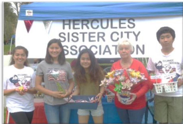
Youth Ambassadors pose in front of their origami and flag booth at the Hercules 4 th of July event